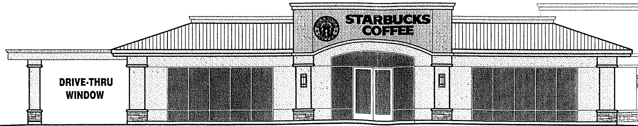
PARKING LOT ELEVATION